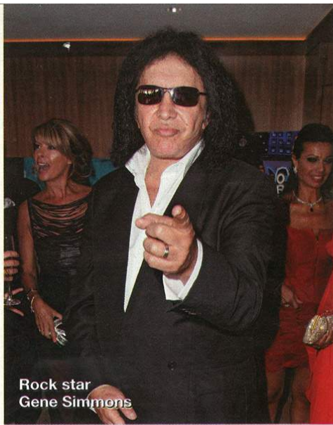
Rock star Gene Simmons